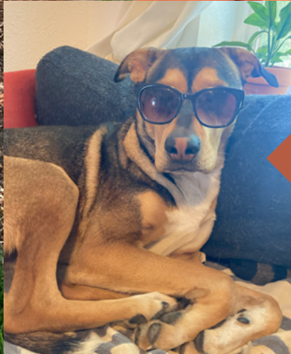
MEET TENGO Chief Dog Officer